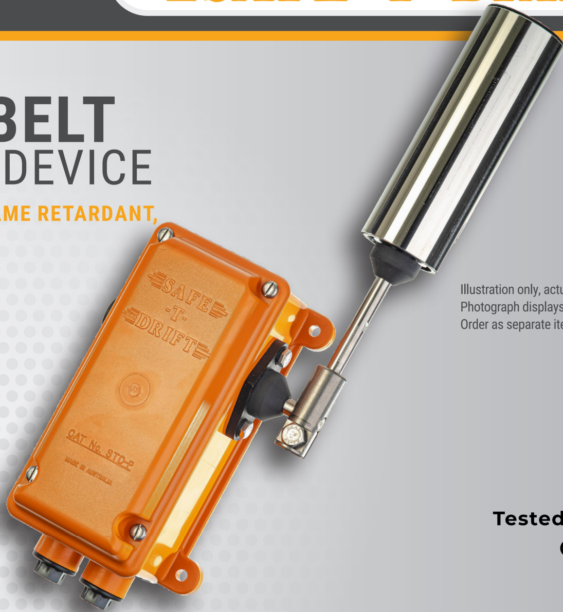
Illustration only, actual product may differ. Photograph displays vertical roller arm fitted. Order as separate item.

UV STABLE, IMPACT MODIFIED, FLAME RETARDANT, PC/PBT ENCLOSURE.