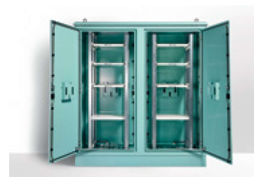
(Shelves not included)