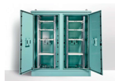
(Shelves not included)