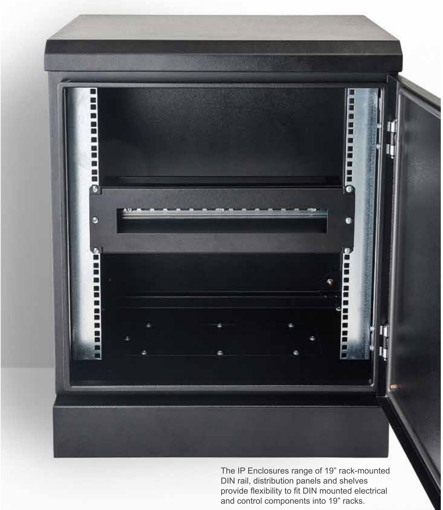
The IP Enclosures range of 19" rack-mounted DIN rail, distribution panels and shelves provide flexibility to fit DIN mounted electrical and control components into 19" racks.