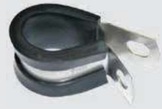
STAINLESS STEEL RUBBER CABLE CLAMPS