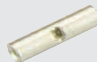
UNINSULATED BUTT SPLICE