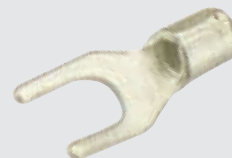
UNINSULATED SPADE TERMINALS