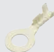
"F" CRIMP RING TERMINALS