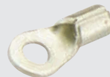
UNINSULATED RING TERMINALS