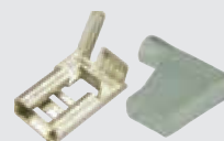
FLAG TERMINAL & INSULATOR