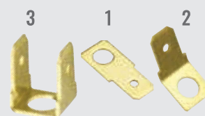
QUICK CONNECT TABS