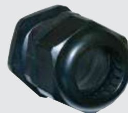
NYLON CABLE GLAND