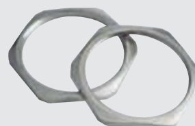
REPLACEMENT METAL LOCK NUTS