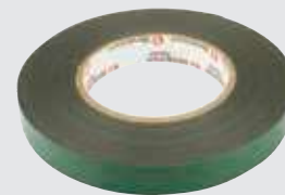
DOUBLE SIDED TAPE