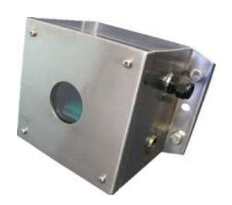
BSH IS Barrier Box For hazardous applications