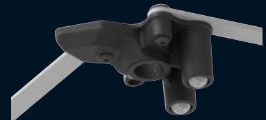
Single handle multi cam locking system IP65