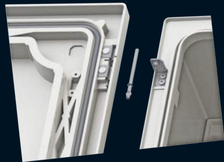
Easily Removable door