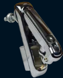
Chrome handle locking mechanism.