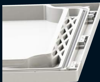
Extra strength lid