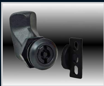
Single cam individual locking system IP66