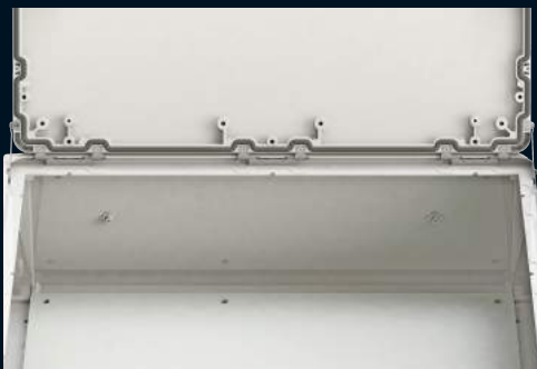
Internal Stainless steel hinges.