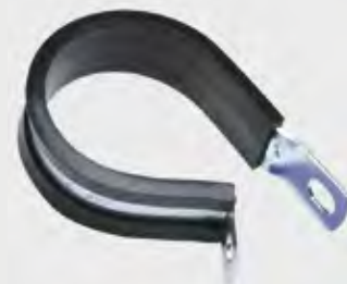
METAL / RUBBER CABLE CLAMPS