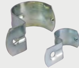
SINGLE SIDED SADDLES