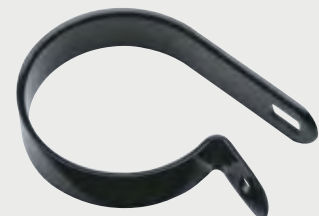
NYLON CABLE CLAMPS