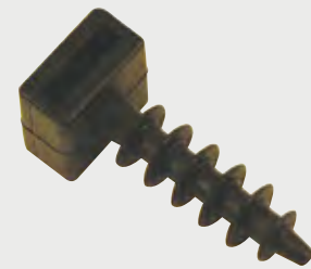
MASONRY CHRISTMAS CABLE CLIP