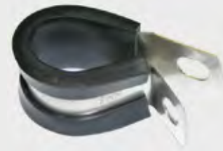
STAINLESS STEEL RUBBER CABLE CLAMPS