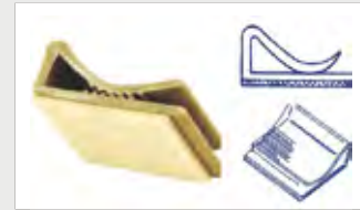
ADHESIVE RIBBON CABLE CLIP