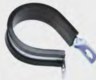
METAL / RUBBER CABLE CLAMPS