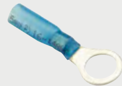
HEAT SHRINKABLE PRE-INSULATED RING TERMINALS

IDEAL CRIMPING TOOL- 0560 & 0560 ULTRA ► SEE FROM PAGE 109