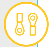
HEAT SHRINKABLE PRE-INSULATED SPADE TERMINALS