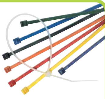
Coloured Cable Ties