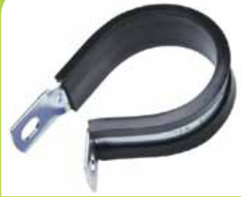
Metal Rubber Cable Clamps