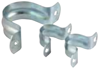
Double Sided Saddles