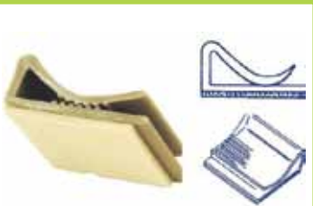
Adhesive Ribbon Cable Clip