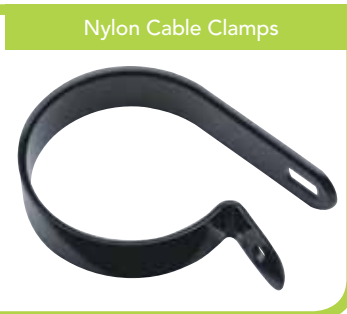
Nylon Cable Clamps

Note: All prices in catalogue exclude GST.