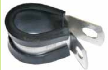
Stainless Steel Rubber Cable Clamps