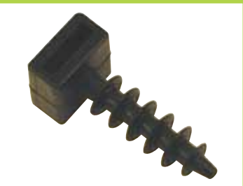
Masonry Christmas Tree Plug