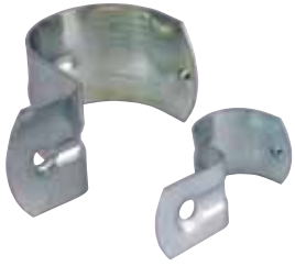
Single Sided Saddles

CARROLL now offers a comprehensive range of heavy duty Single and Double Sided Saddles. Saddles are made from high quality, zinc plated, cold rolled steel. Saddles feature pronounced gusseting (ridging) and pre formed fixing holes. All saddles are produced with a superior steel thickness to ensure strength and durability.