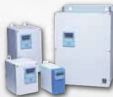
IP30 & IP66 enclosed MSC-3