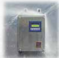
Washdown IP66 Stainless Steel